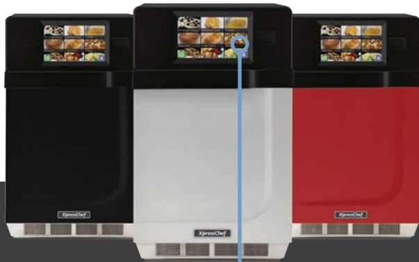
True-Touch™ HD Touchscreen